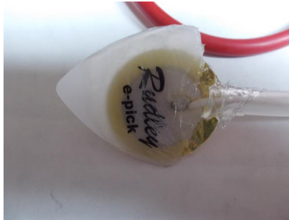
P/N EP100-001 – Front View