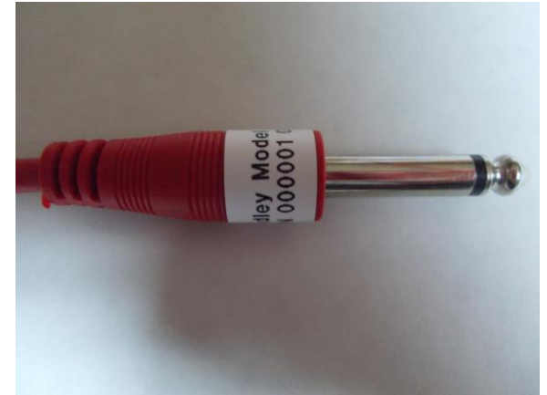
P/N EP100-001 – ¼ inch plug