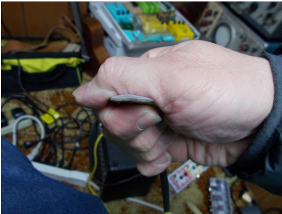
Suggested Grip3 – Cord held by all fingers – Full Hand Hold