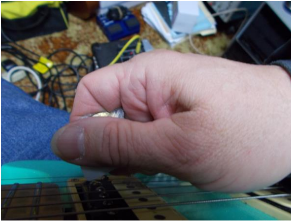
Suggested Grip2 – Cord between index & middle finger – Cigarette Hold