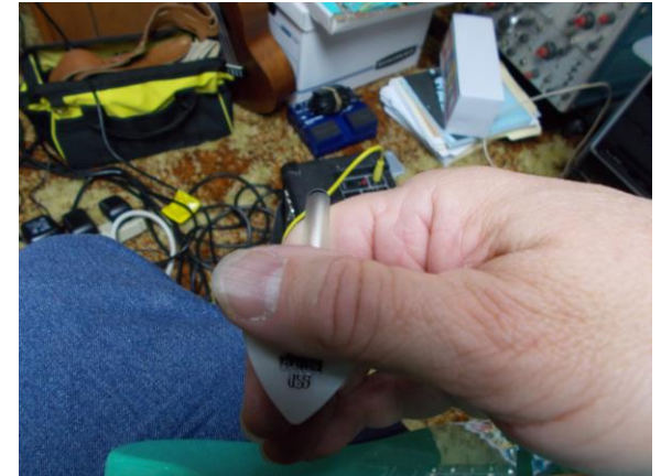
Suggested Grip1 – Bend Cord Between Thumb & Index Finger – Light Hold