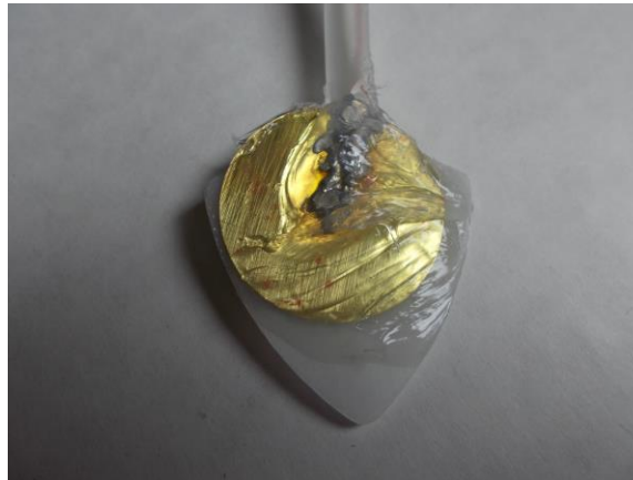
P/N EP100-001 – Back View